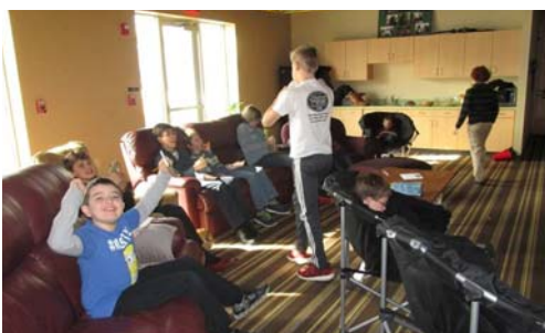
The kids enjoyed a movie & popcorn while the adults attended the meeting!