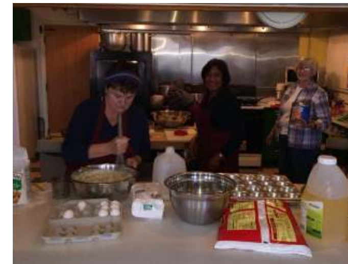
Some St. Tim's volunteers help prepare Peace Meal at St. John's

"We need for you to volunteer—and most important, we need you to add your name to the sign-up sheet in the Gathering Space, so we know we have enough volunteers."